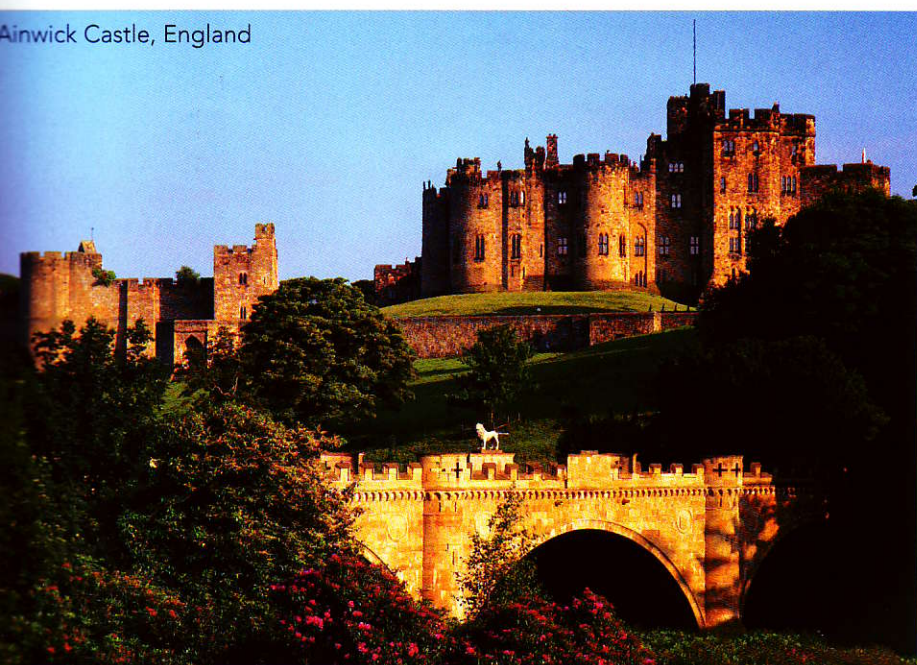
Ainwick Castle, England